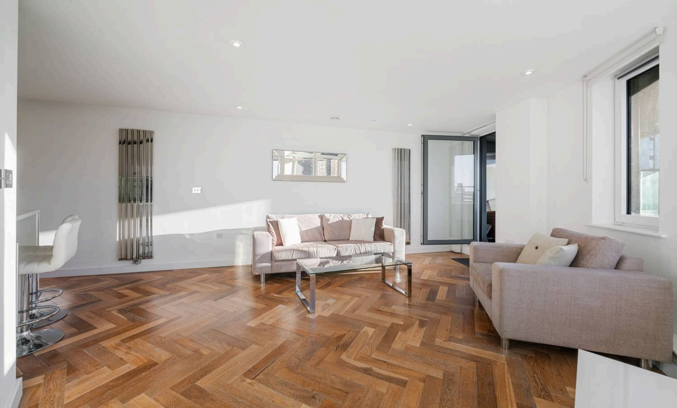
Flat 73, Eagle Point City Road, London London