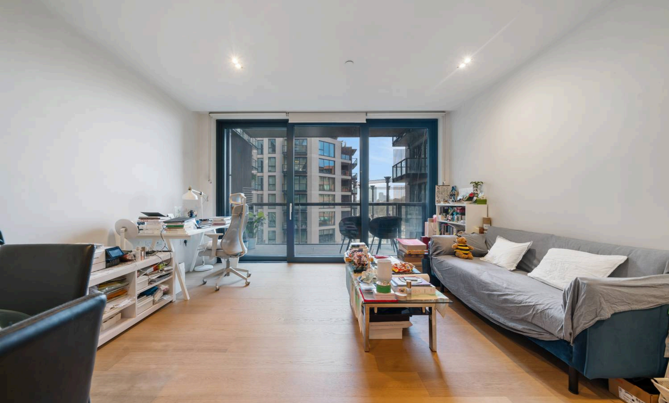
Apt F5-12, Plimsoll Building, 1 Handyside Street London